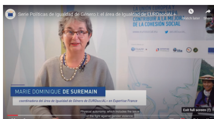
Gender Equality Policy Series I: the EUROsociAL+ Equality area