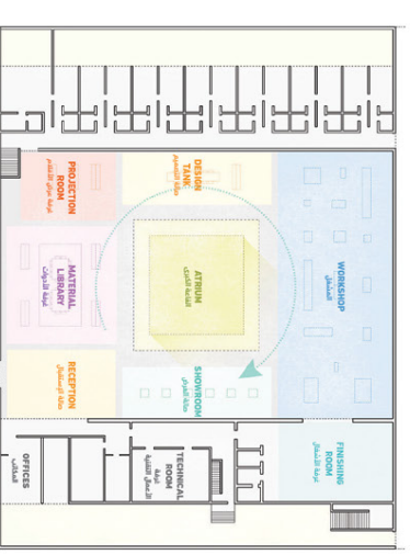
Floor plan of the platform