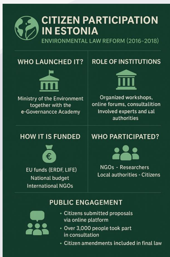
Figure 3 Stakeholder Participation in the Revision of Estonia's Nature Conservation Act (2016–2018)

This proactive approach demonstrates how combining early-stage engagement with diverse funding sources can foster transparent, responsive environmental legislation. It created shared ownership of policy outcomes and fostered broad trust in institutions.