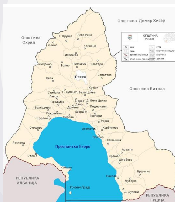
Figure 1 Boundaries of the Municipality of Resen